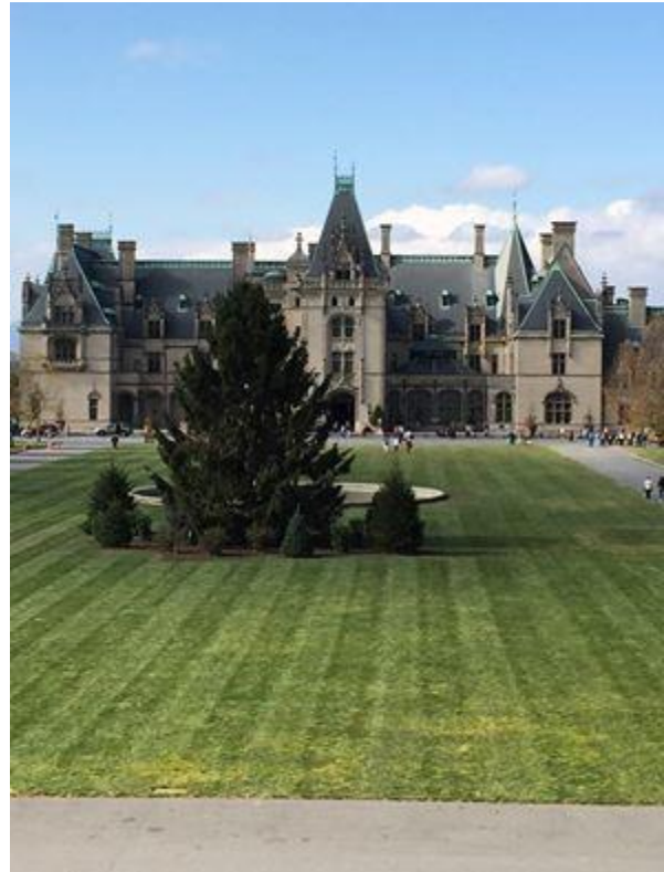
Biltmore – America’s Largest Home