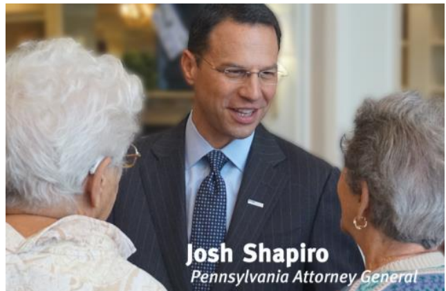
Josh Shapiro Pennsylvania Attorney General

Pennsylvania has one of the highest senior populations in the country and our seniors are more active than ever. The Office of Attorney General is here to help protect and educate seniors on what to watch out for when they are out socially, traveling or simply enjoying their home life.