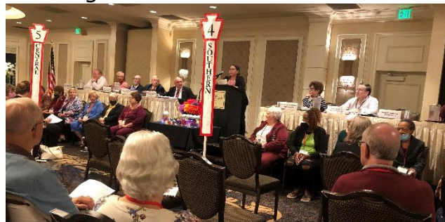
Memorial Service at HOD

program, From Vanderbilt's Folly to the America's Super Highway . She provided a lot of historical information about what led to the creation of the PA Turnpike. She then presented her program at the Mercer County meeting on October 13 th .