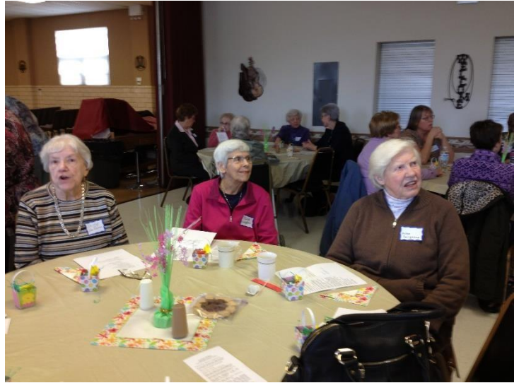
March 26 luncheon meeting scenes